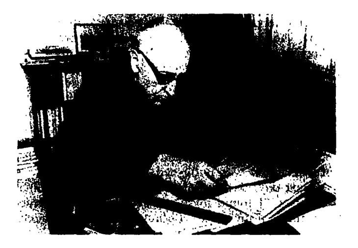
At work on the Memoirs, Vienna.

Despite the Pope's assurance that it was not necessary for the Cardinal to show him the address he had prepared for a celebration in Fatima, Portugal, the nuncio's office censored it at the last minute in the printshop. A paragraph was deleted, including the following: "The East proclaims that there even the worst apostates have become gentle lambs. Do not believe it! You shall know the tree by its fruits. It is possible that in the East there are more churchgoers than in many a Western country, but that is not to the credit of the regime there, but of those Christians who manage to walk bowed down by the weight of the cross."